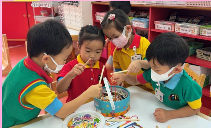
We are fishing together, it is so funny. 我們正在一起釣魚，真有趣。