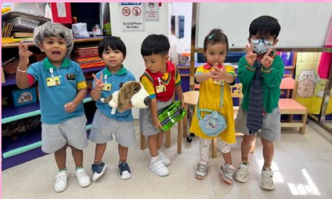
We are doing role-play : My Family! So funny! 我們正在扮演「我的家庭」，真有趣！