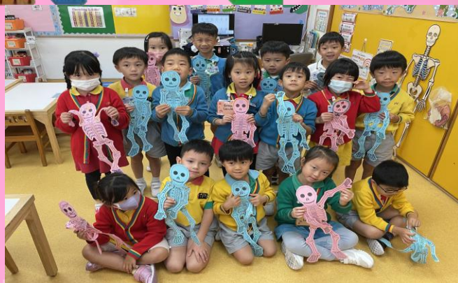
Our skeletons can dance to the tune 'Dem Bones'. 齊來用自己設計的骨骼來跳舞吧！