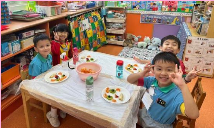
Look at our lovely 'fruity face'!! 看看我們可愛的「水果面孔」！