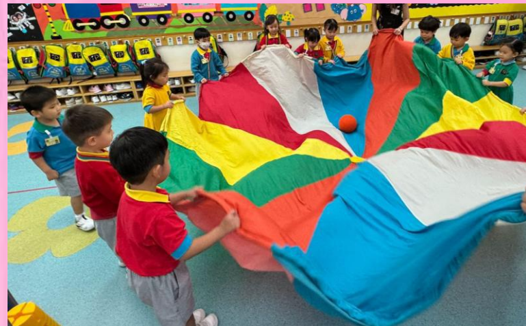
We are playing with the rainbow parachute during physical activity! 彩虹傘真有趣!