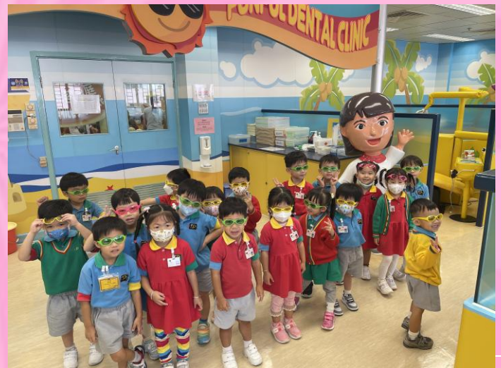
Visit to Brighter Smiles Playland. 「好玩牙科診所」很好玩!