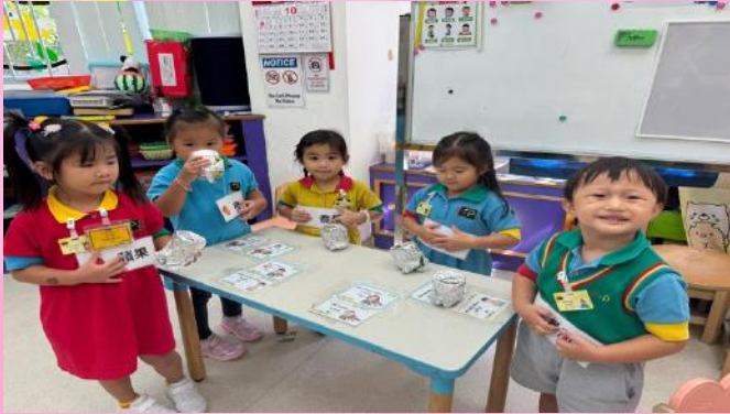
We are undertaking a scent exploration activity. 我們正在進行「氣味探索」的活動。