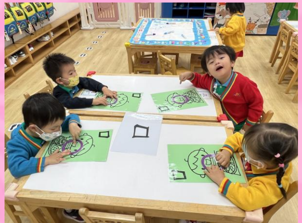
We're learning to identify facial features.