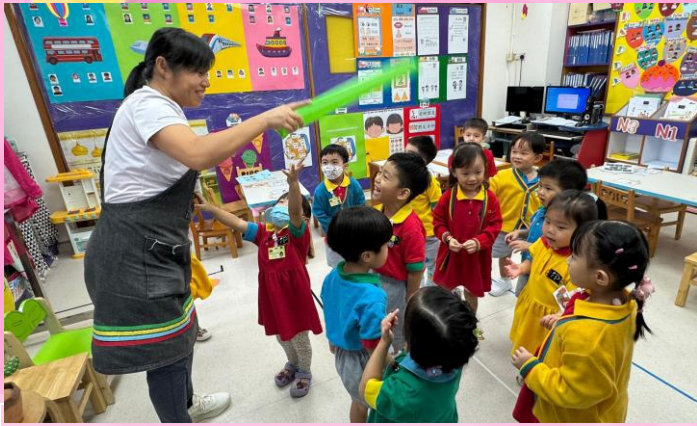
We love playing Putonghua games! They are so funny! 我們正在玩普通話遊戲。