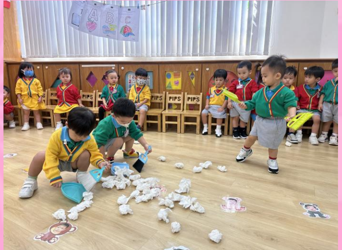
We are learning to clean up! 我們正在學習清潔!