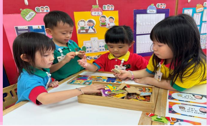
We helped each other to complete the puzzle together. 我們互相幫助，一起合作完成拼圖