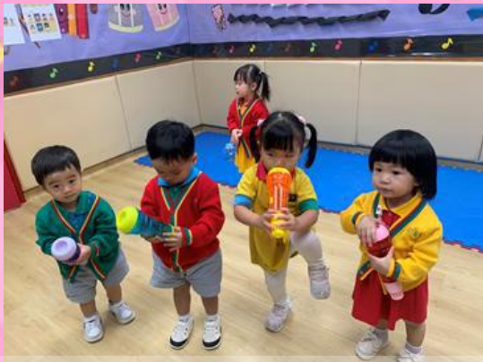
Fun with music and movement.