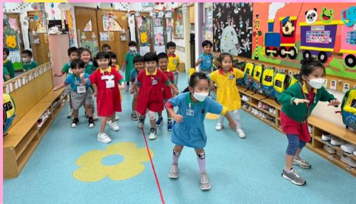
We love playing games together. 「紅綠燈 過馬路 要小心」!