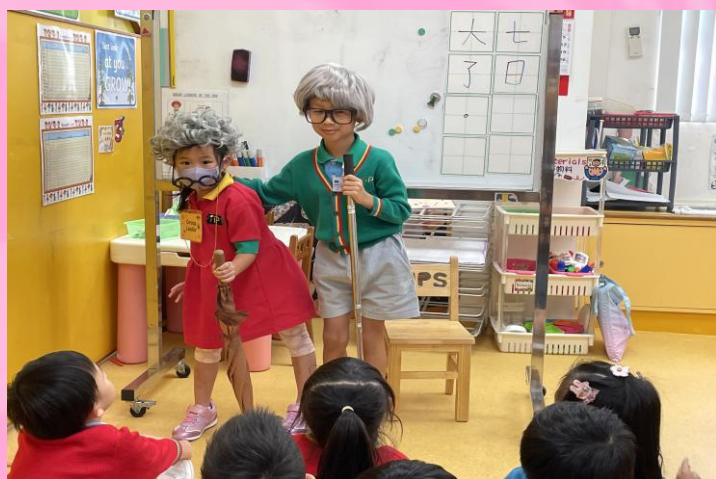
It was really hilarious, we turned into grandparents! 我們變成了公公婆婆，真有趣！