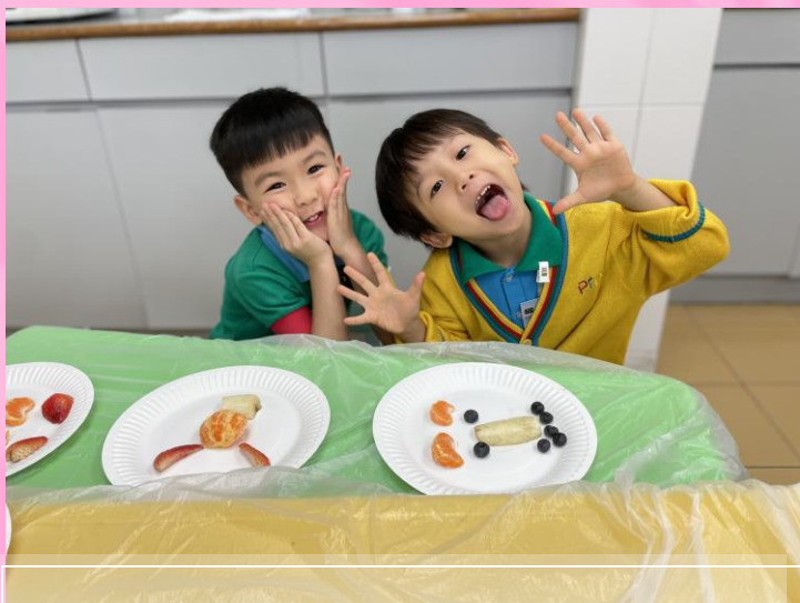
Let's use fruits to create our own faces! 一起用水果來設計自己的五官吧！