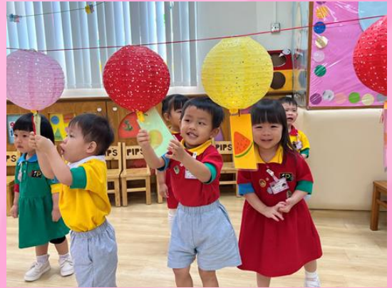
Celebrating Mid-Autumn festival with friends.