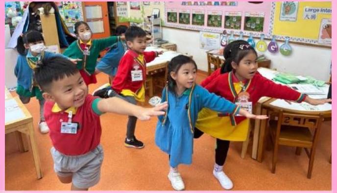
We are doing exercises for our body health~ 我們正在拉拉筋，伸展身體~