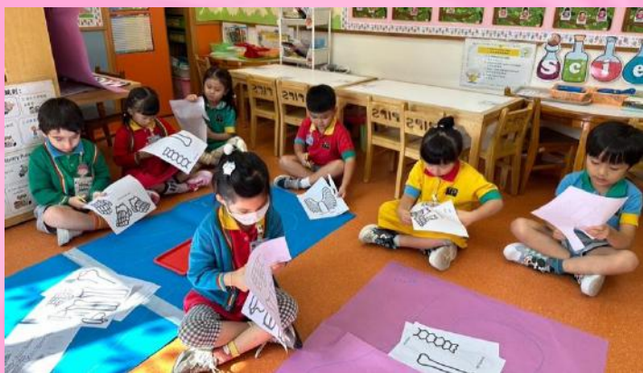
We have many bones in our skeleton. 原來我們有那麼多的骨頭。