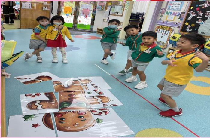
We cooperated with each other. SUCCESS! 我們合力完成超大的拼圖。