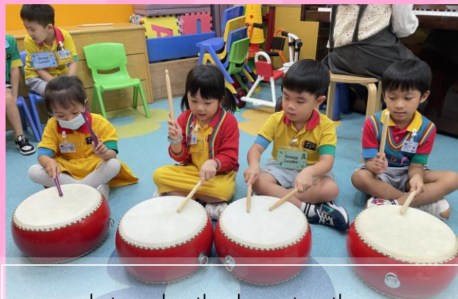
Let us play the drums together. 你們來唱歌，我們還用樂器作伴奏。