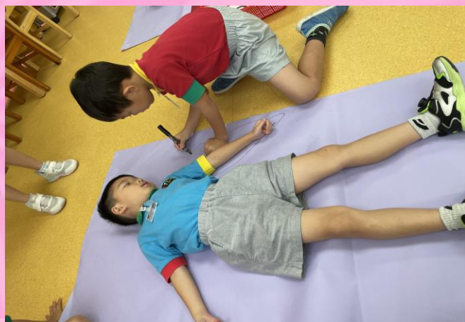
We are tracing the body outline for the artwork. 我們正在畫身體的輪廓。