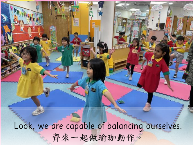
Look, we are capable of balancing ourselves. 齊來一起做瑜珈動作。