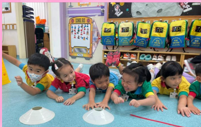
We are flying! 我們飛起來了!