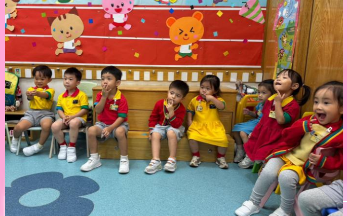
We are learning about our body parts! 我的身體真奇妙!