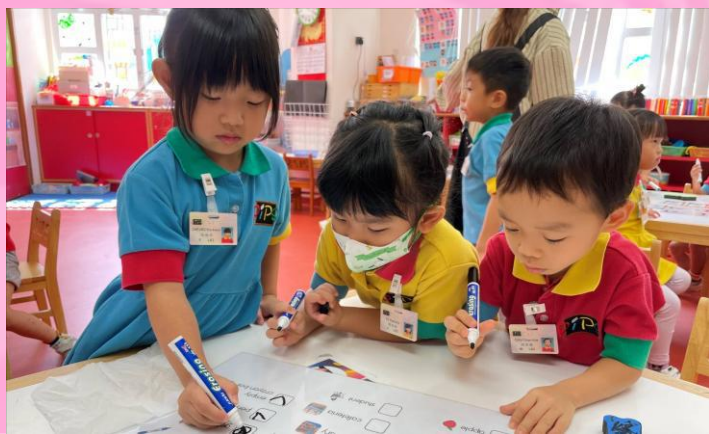
We are documenting the items present in the classroom. 我們一起記錄課室中有什麼物品。