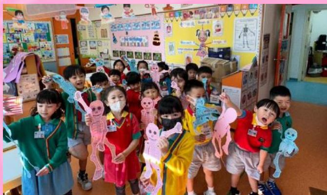
Let's do the skeleton dance!! 一起舞動起來吧!