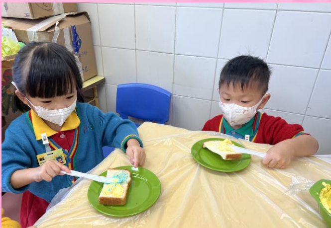
We're making beautiful and delicious rainbow bread. 我們在製作漂亮又美味的彩虹多士。