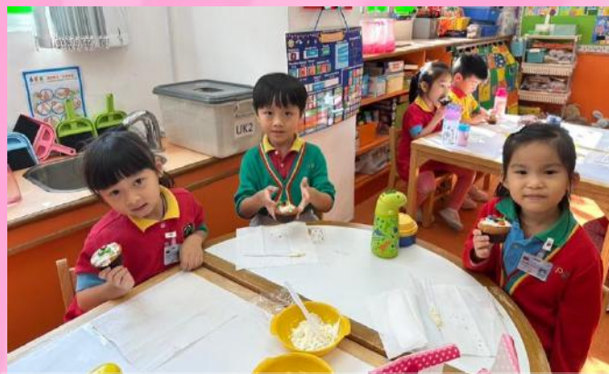
We decorated our own cupcake. 我們製作了美味的杯子蛋糕。