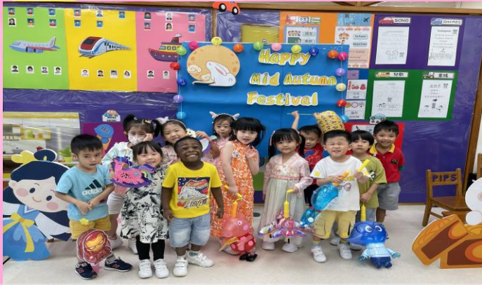
Happy Mid-Autumn Festival Everyone! 祝各位中秋節快樂！