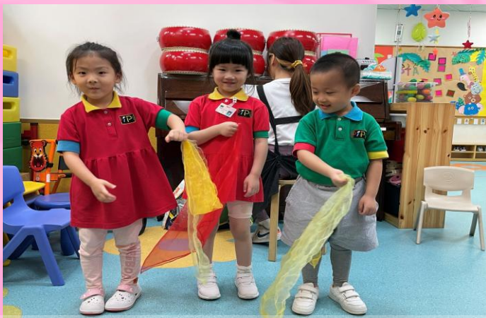
Let's wave the scarf to the music, Yayyyyyyy!!! 大家跟我們一起揮動圍巾吧！