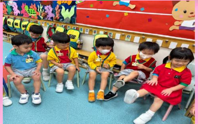
We are playing games based on the song 'My Body'. 我們正在跟隨歌曲《我的身體》玩遊戲。