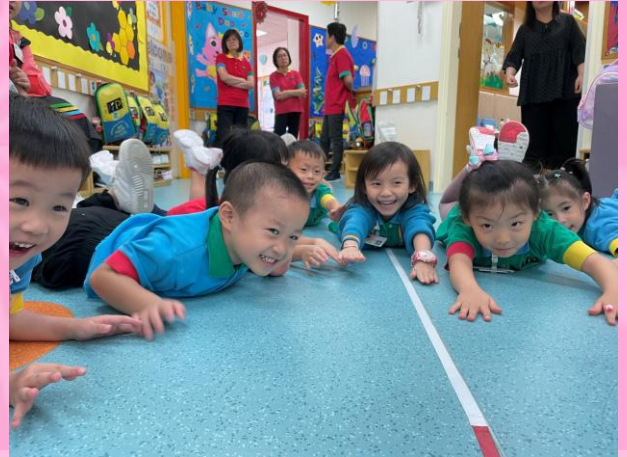
We are 'flying' on the ground!! 我們正在地上「飛行」