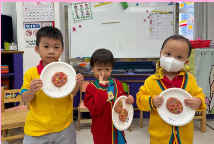
Let me show you my handmade cookies. 讓你們看看我的曲奇餅。