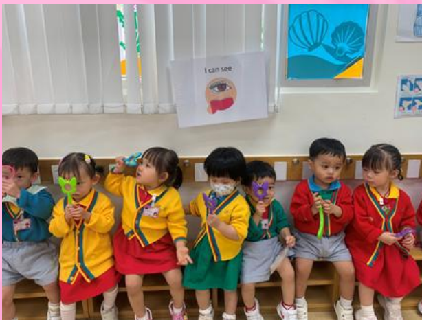
We're learning about our body parts.