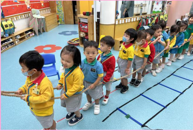
Choo choo, the N2 train is going to visit different corners of the campus. 鳴—鳴— N2 列車正出發參觀校園的不同角落。