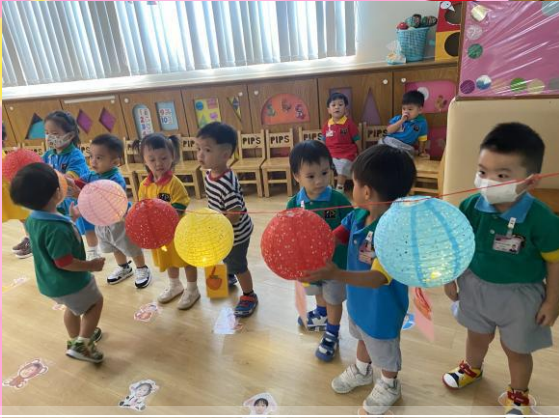
We are celebrating Mid Autumn festival! 我們正在慶祝中秋節!