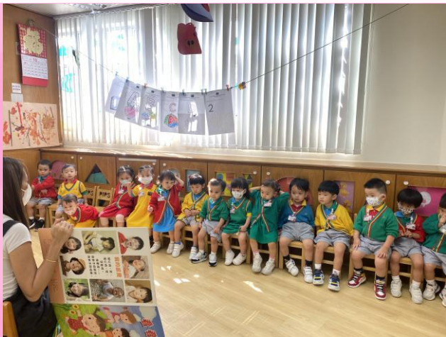
Identifying the 5 senses! 我們正在認識不同的感官!