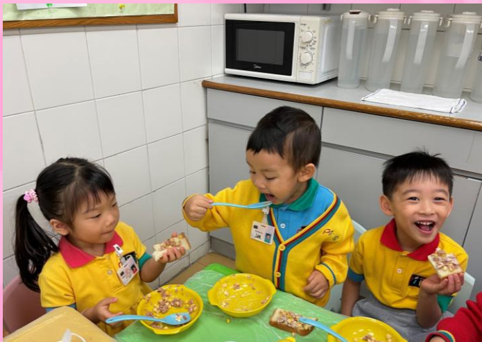
This is our first cooking lesson. Yum! 這是我們自製的吞拿魚三文治，請你吃。