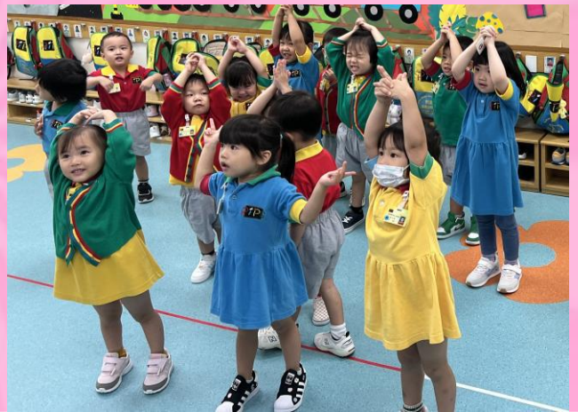
Let's do morning exercises together to stay healthy. 齊做早操身體好。