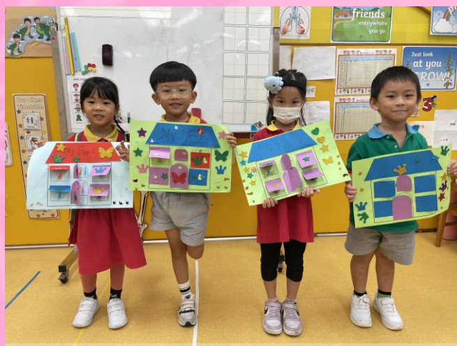
We enjoyed decorating 'My Family' artwork. 大家齊來看看我的家。