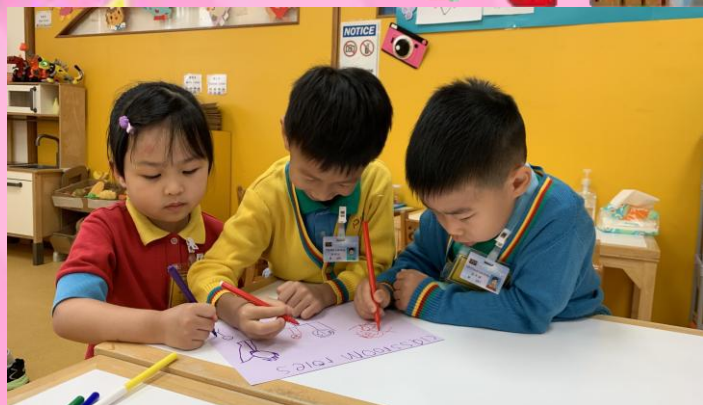
We're implementing some new classroom rules. 我們一起訂立新的課室規則。