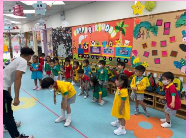
Let's do exercise along to the song! 我們一起跟隨歌曲做運動吧！