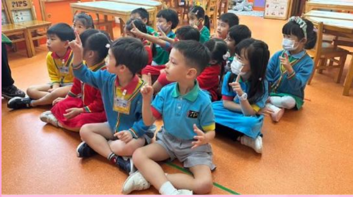
We are number ONE!!!! 我們是最棒的！