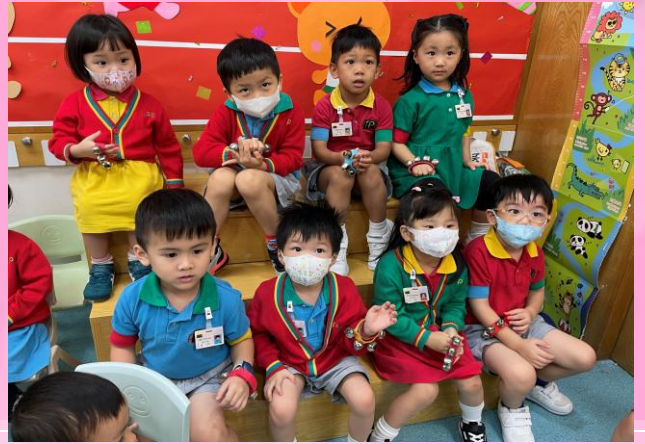
Our singing voices are so good! 我們喜歡唱歌，更喜歡玩樂器。