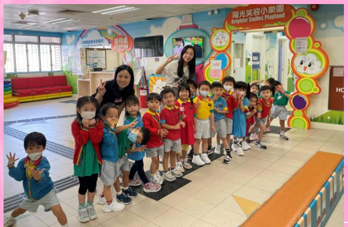
Let's learn how to protect our teeth together. 一起來學習如何保護我們的牙齒。