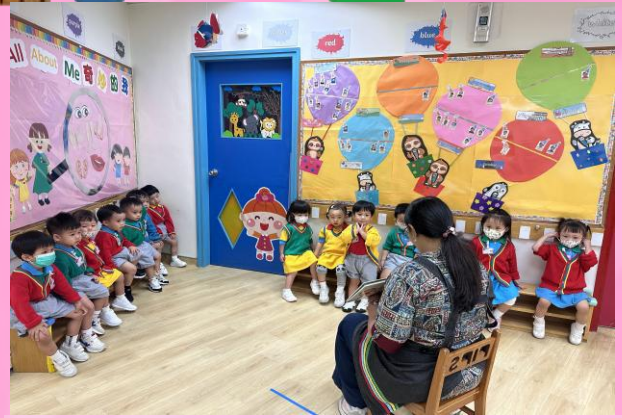
We like to listen to stories! 我們喜歡聆聽故事!