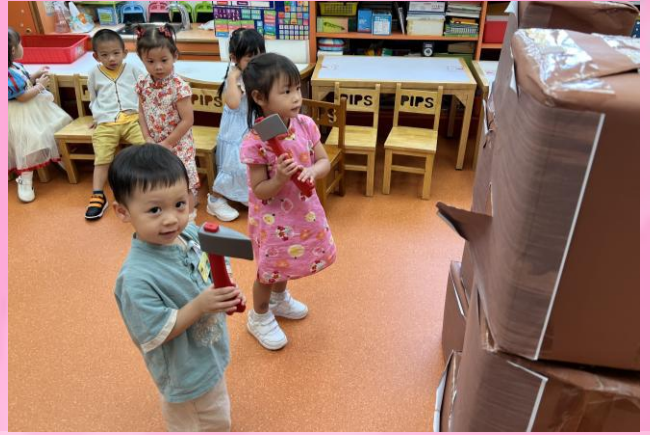
We're playing the role of Wu Gang and chopping the trees, so much fun! 我們在扮演吳剛伐桂的情節，真有趣！